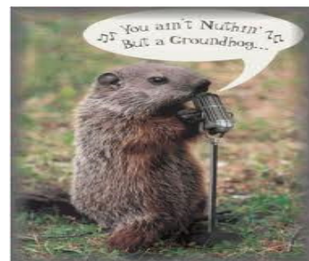
Happy Ground Hog Day!

It's that time of year again to think about getting your taxes ready. If you need a Donation Statement from St. Maria Goretti, please call the office at 309-799-3414.